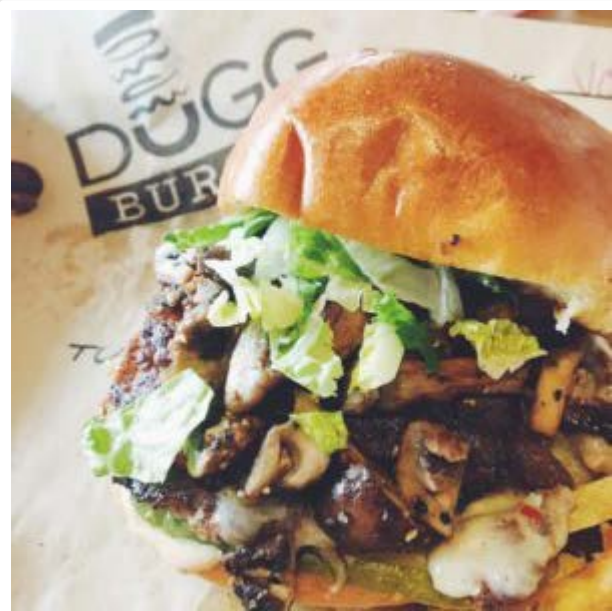
Here's my Dugg Burger: a beef patty with pepper jack cheese, greens, Dugg sauce, mushrooms, sautéed onions and hickory smoked bacon... Mmmm.

The toppings. Like I stated above, you get to choose from 13 toppings to add onto your Dugg Burger. Twelve of those toppings are house toppings, the 13th is ever changing. My oldest ventured out and tried some delicious new toppings that he never gets to try at a typical burger place. He loved it!